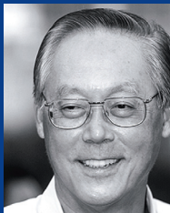
2006 Mr Goh Chok Tong Senior Minister Republic of Singapore