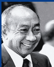
1973 The Late Dr Goh Keng Swee Deputy Prime Minister Republic of Singapore