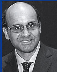
2010 Mr Tharman Shanmugaratnam Minister for Finance Republic of Singapore